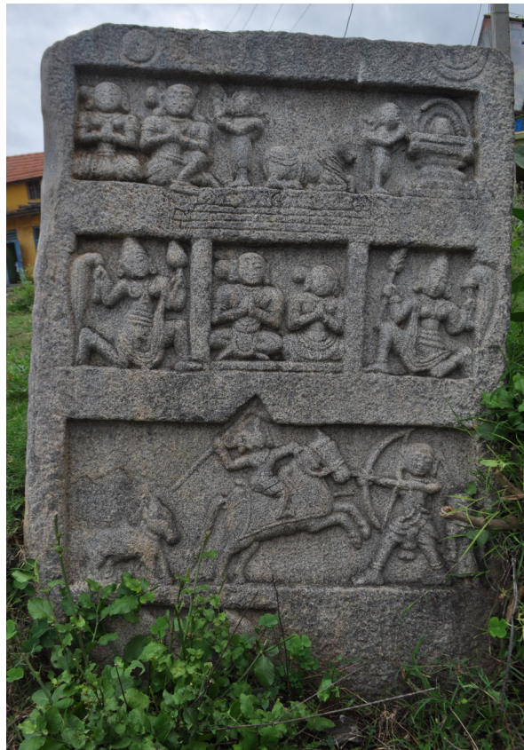
Plate 5: Un-inscribed Hero stone, Hemmanahalli, Karnataka