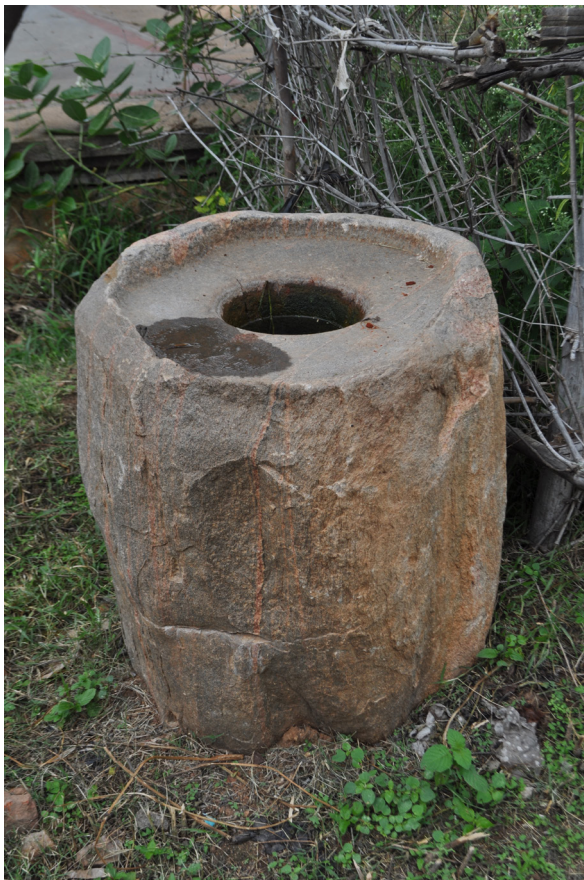
Plate 3: Uninscribed Oil Pressing stone, Arechakanahalli