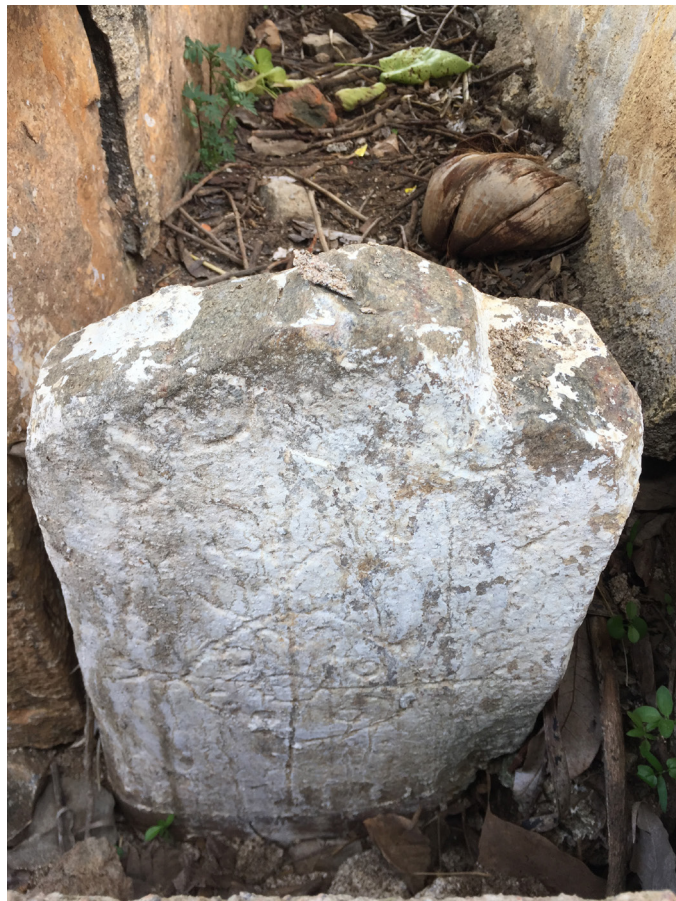
Plate 17: Sanniyasi Kal, Gudigere