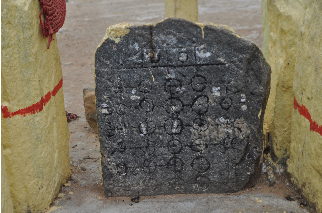
Plate 16: Sanniyasi kal, Somanahalli