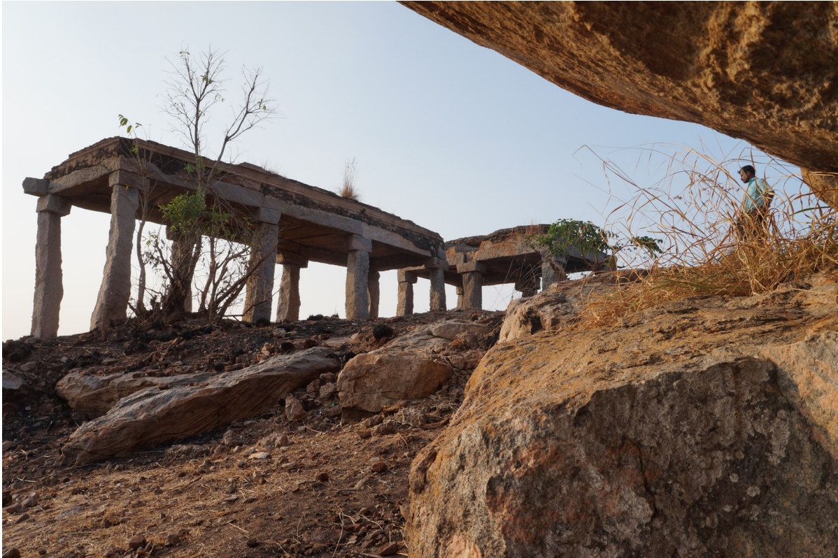
Plate 14: Dilapidated Fort, Thopanhalli