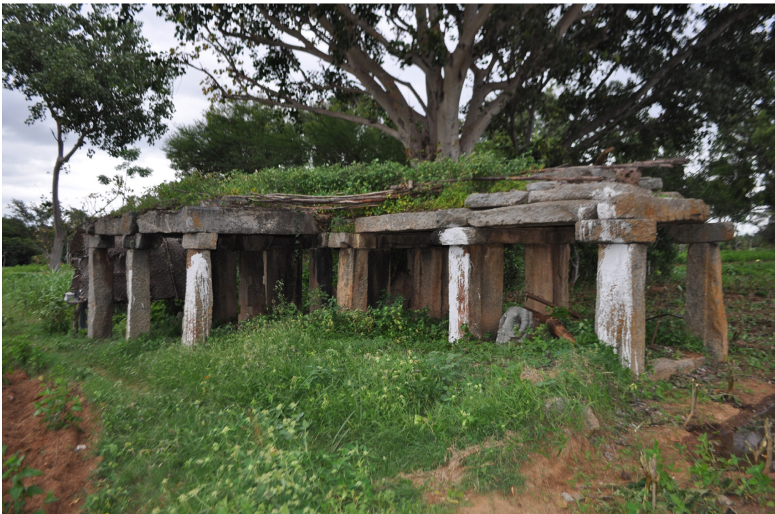
Plate 11: Dilapidated Temple, Mallanakuppe