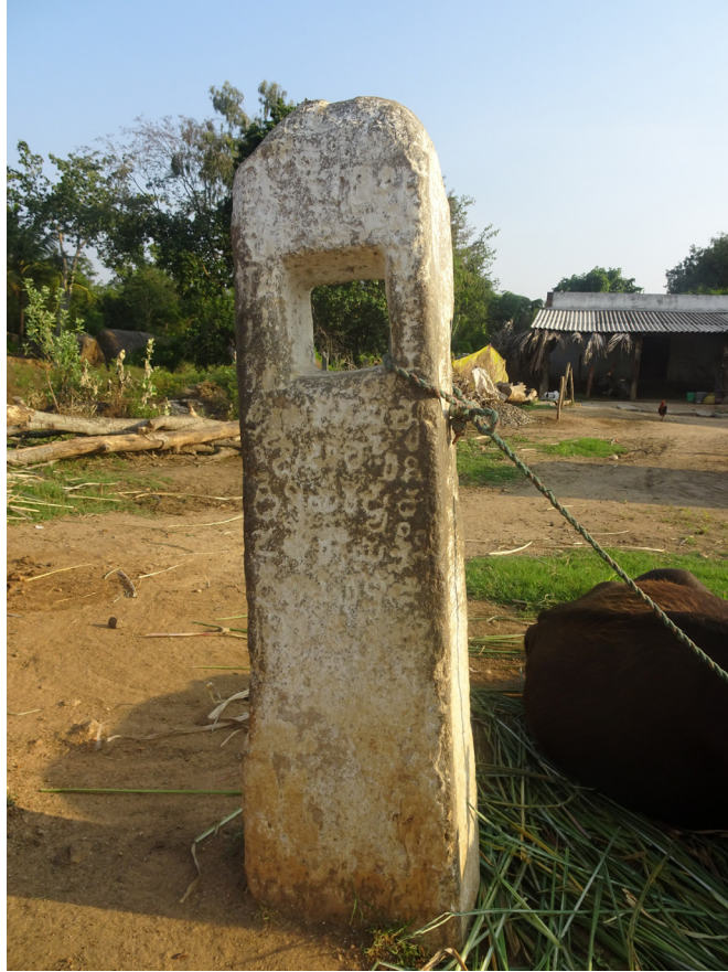
Plate 10: Inscribed Go-Kallu, Malaganahalli