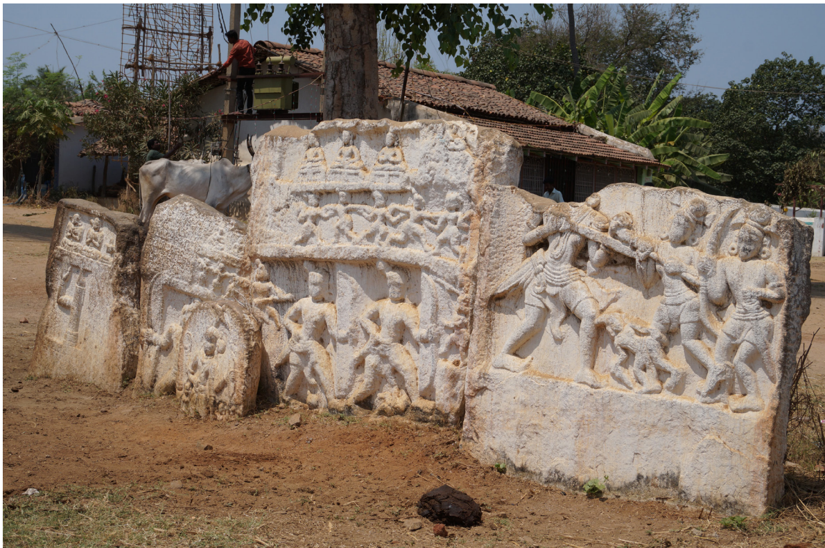
Plate 15: Memorial stones, Tore Bommanahalli