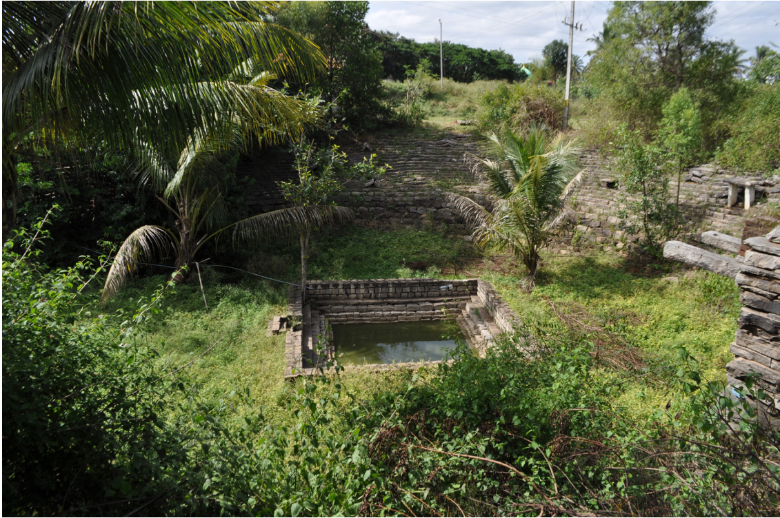
Plate 12: Kalyani (water tank), Nidaghatta