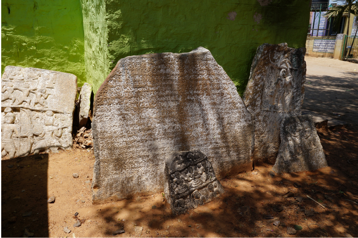
Plate 4: Inscribed Stone, Boppasandra