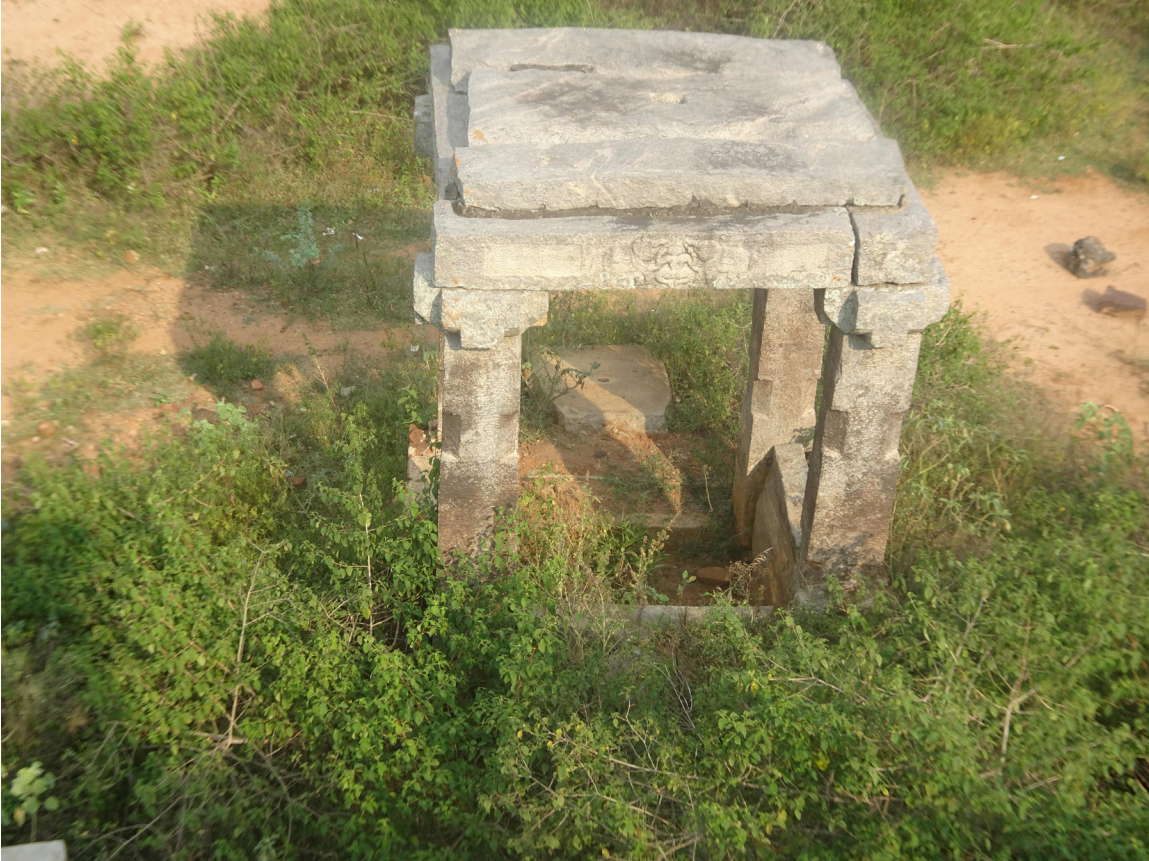
Plate 9: Inscribed Sluice Gate, Madhanayakanahalli