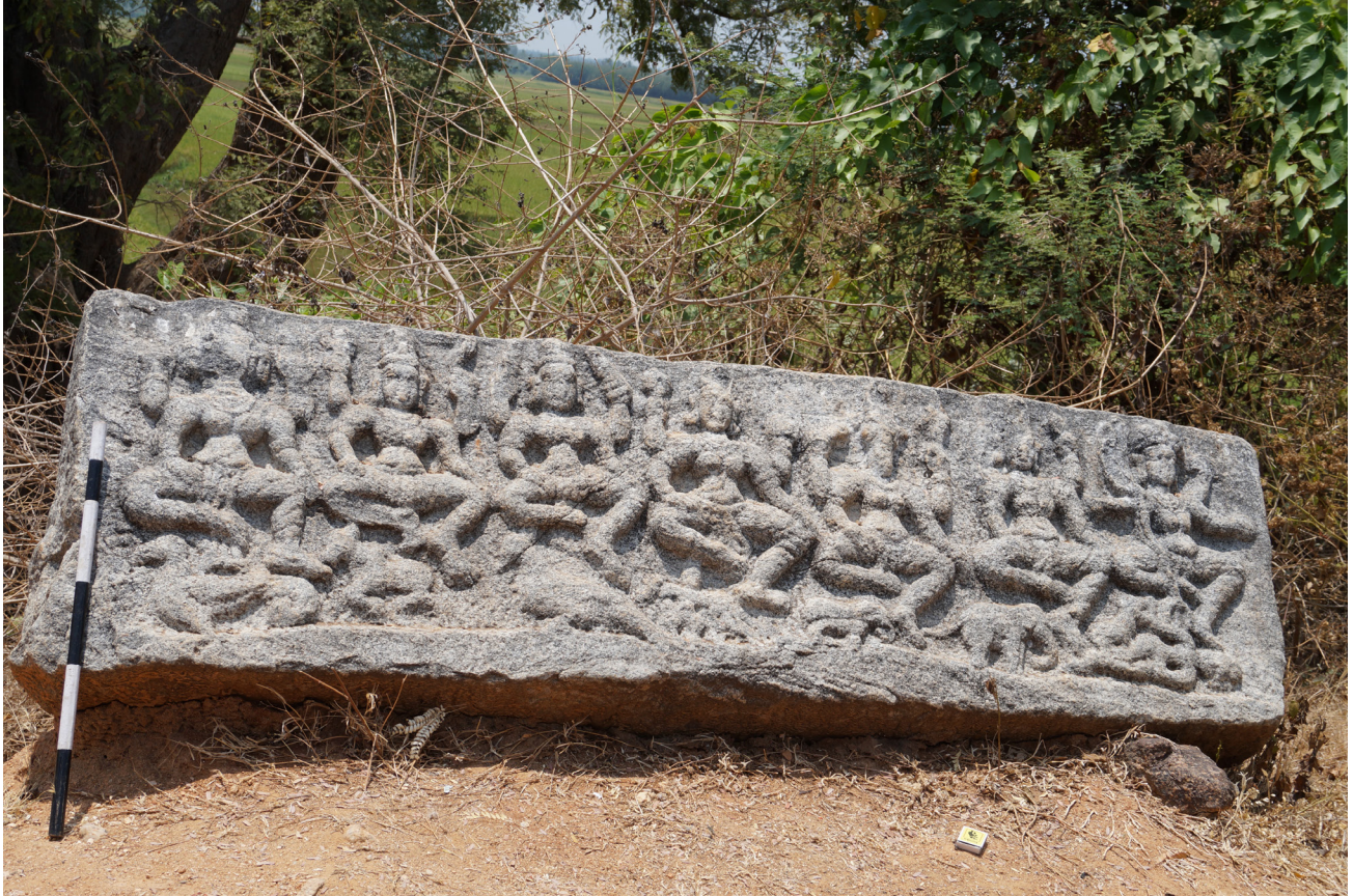
Plate 2: Saptamatrika panel, Agaralinganadoddi