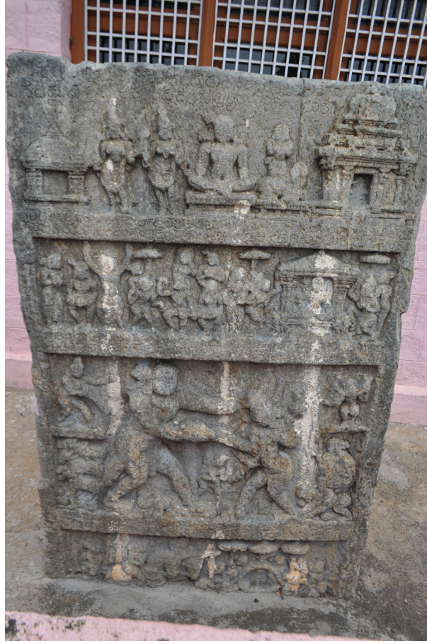
Plate 6: Sluice gate, Honnayakanahalli