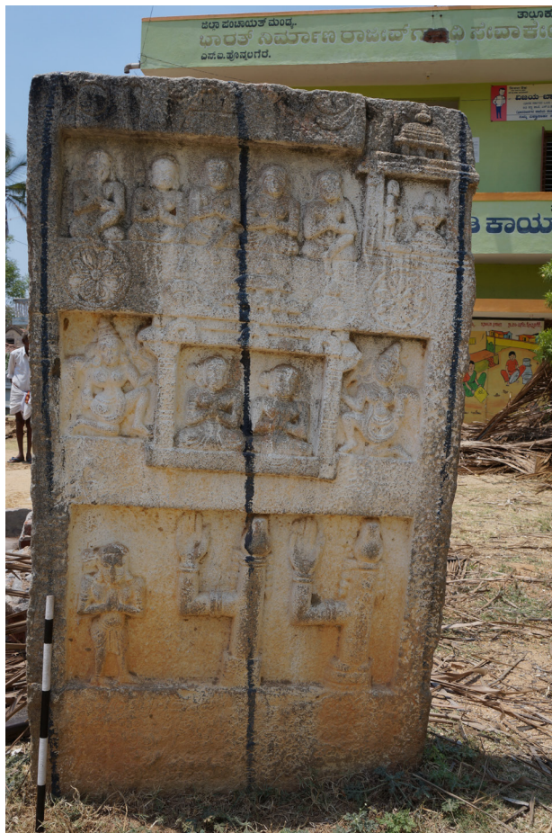
Plate 13: Inscribed Sati Stone, S.I.Honnalagere