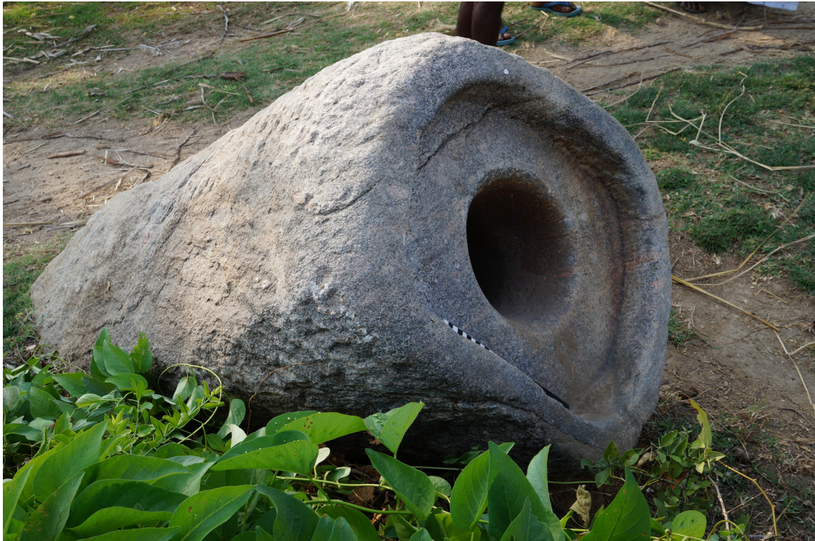
Plate 7: Inscribed Herostone, Kadalavagilu